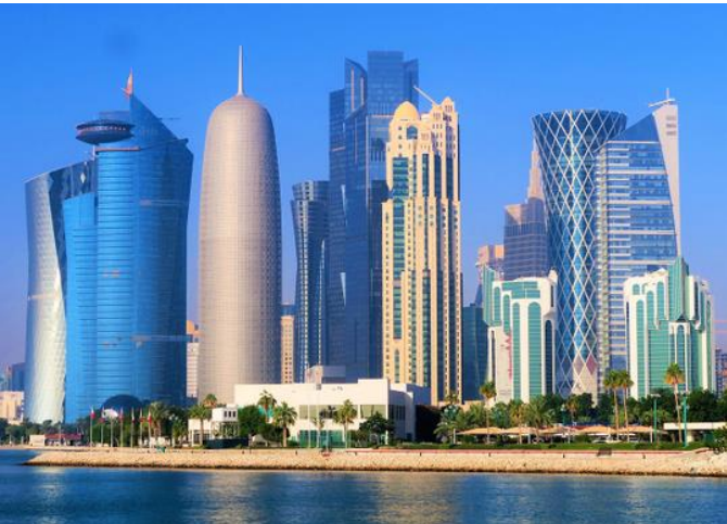
AllGoVision Video analytics applications for BFSI